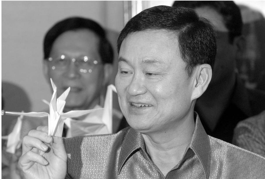
In November 2004, Prime Minister Thaksin “sought to create a positive news bonanza by asking Thais to produce millions of origami cranes to be scattered over the South, in a gesture indicating the popular desire for peace.”